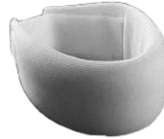
Soft cervical collar

Rigid braces are made from molded plastic with a removable padded liner in two pieces—a front and back piece—fastened with Velcro. This brace is used to restrict neck movement during recovery from a fracture or surgery (e.g., fusion). Common rigid braces are the Philadelphia collar and the Miami J collar.