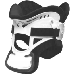
Miami J collar